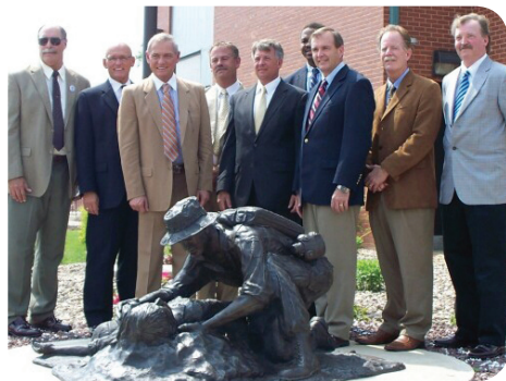
The Caucus was represented at Lock Haven University during the dedication of the Combat Medic Statue.

The Veterans Caucus was honored by the AAPA in the year 2002, as the recipient of a PAragon Award for Public Education for its efforts to increase public awareness, not only about the veteran PA, but the PA profession.