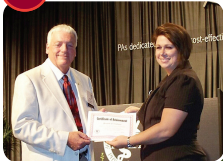
Caucus Scholarships have been awarded to deserving veteran recipients for many years.