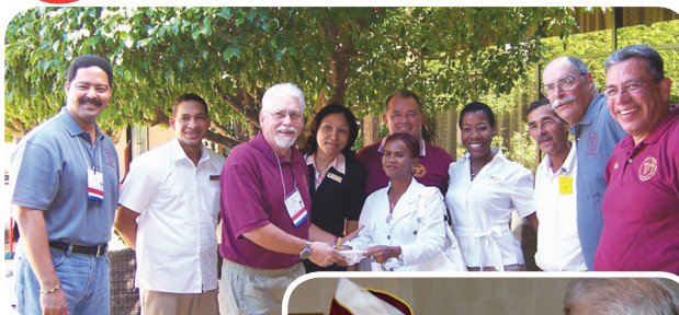
Each year, the Caucus donates to organizations, such as, orphanages and veterans groups.