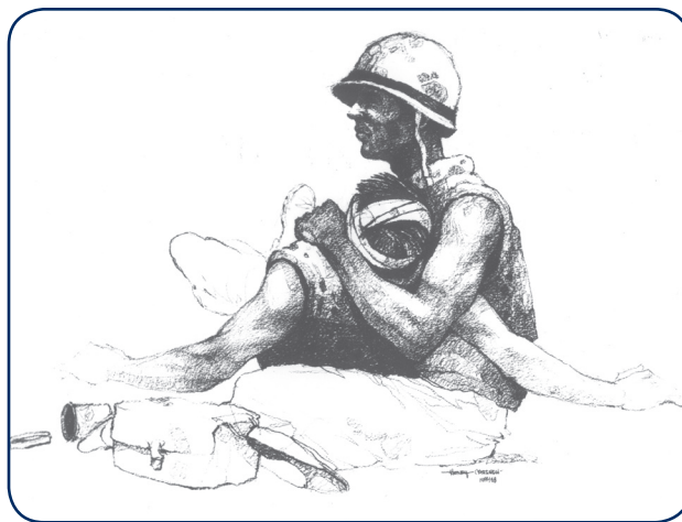
by Henry Casselli